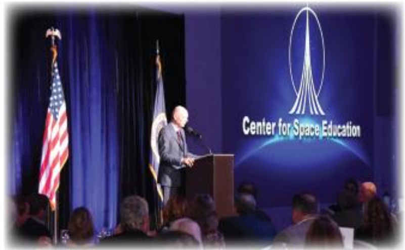
Congressman Posey discusses space issues and his efforts to boost opportunities for American science students.

As the new Congress convenes in 2023, Republicans hold a narrow majority in the House of Representatives. While this is an opportunity to reverse failed policies and put our country back on track, I believe decisive action to address the most important issues facing our nation will be met by opposition in a gridlocked Congress. Despite this challenge, I am confident we will advance important legislation and solid initiatives that benefit our district and nation.