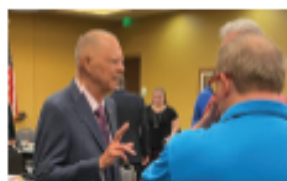
Congressman Posey talks space issues in Titusville.

By extending existing space launch tax incentives for companies that launch their payloads from the United States, Congressman Posey's bill incentivizes further private-sector investments in advanced space technologies and infrastructure.