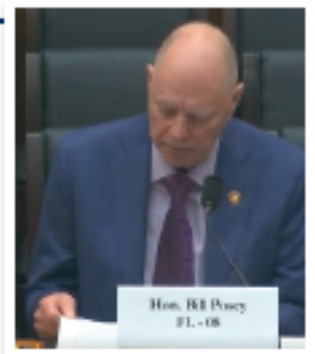
Rep. Posey testifies before the House Appropriations Committee for strong funding for our National Estuary Program.

The PFAS Action Act will mobilize a muscular response to PFAS under the Comprehensive Environmental Response, Compensation and Liability Act — it accelerates drinking water regulations, and provides robust funding to address and remediate PFAS impacts. The legislation builds on progress made in this year's National Defense Authorization Act, which prohibited the use of PFAS containing firefighting foam on military bases. Last year Rep. Posey worked with residents and the Army Corps of Engineers to officially designate South Patrick Shores a Formerly Used Defense Site – a major step in remediation and fighting PFAS contamination.