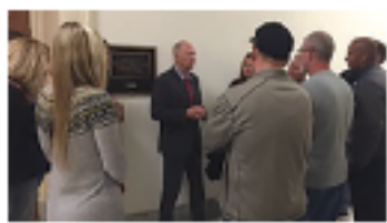
Rep. Posey talks space issues with KSC workers visiting Washington, DC.

The future of American space launch companies is threatened by increased subsidies from foreign governments. This harms American workers, U.S. companies and undermines our national security.