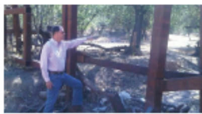
Rep. Posey tours our southern border and is briefed on how dangerous and open parts of it have become.

There are unfair practices coming from China, Russia, India and Europe, and Rep. Posey said that a strong domestic space launch industry is in our national security interest. "This bill assists our domestic space launch industry, keeps America first in space, enhances our national security and creates American space jobs."