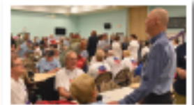
Rep. Posey talks legislative issues with local veterans.

To report a Social Security scam, visit the Social Security Inspector General's website https://oig.ssa.gov/ .