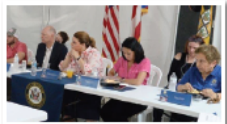
Rep. Posey is briefed by emergency response officials in Puerto Rico.

In Congress, Rep. Posey supported emergency aid to help Puerto Rico recover from the recent earthquakes and the damage that remains from Hurricanes Maria and Irma. The funding includes resources to repair infrastructure like roads and bridges, reopen schools and restore the power grid.