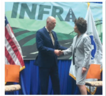
Rep. Posey discusses the Indian River Bridge project with Secretary Chao.

Last year Rep. Posey worked with the Florida congressional delegation, including Senator Marco Rubio, to pass legislation authorizing construction of a new bridge. In July, Transportation Secretary Elaine Chao announced the Agency had accepted Space Florida's application for funding to construct a new bridge. Posey supported Space Florida's bid for the grant and worked with the state's space agency to help navigate the process. "The Indian River Bridge is critical infrastructure to our space capability."