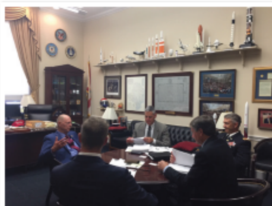
Rep. Posey meets with officials from the Army Corps of Engineers to discuss designating South Patrick Shores a Formerly Used Defense Site. Earlier in the year, Rep. Posey convinced the EPA Administrator to investigate possible contamination in that community.

"... while partisan gridlock has overtaken some important issues, we have also managed to advance solid bipartisan initiatives ..."