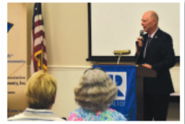
Rep. Posey talks about flood insurance reform legislation with the Realtors Association of Indian River in August.

A reform measure by Rep. Posey was included in H.R.3167, the National Flood Insurance Program Reauthorization Act of 2019 , which was approved by the House Financial Services Committee in June. Posey's proposal (H.R. 342, the FIRM IT Act ) helps FEMA update floodplain maps by requiring the Department of Defense, U.S. Geological Survey, and the National Oceanic and Atmospheric Administration to share all their relevant maps for flood insurance purposes with FEMA. Posey noted that in many cases we haven't updated our floodplain maps in 20 years and that this proposal will help us do that cheaper, faster, and more accurately. "It's a win for both taxpayers and for the beneficiaries of the flood insurance program," said Rep. Posey.