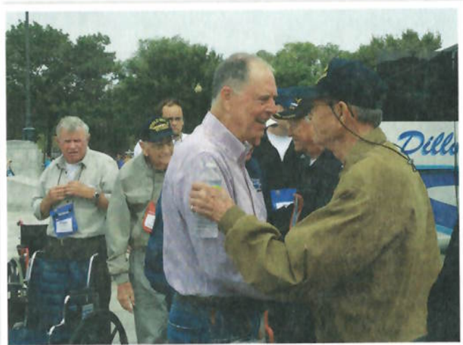
Rep. Posey talks legislative issues with WWII veterans during a recent Honor Flight.

We owe our nation's military veterans a great debt of gratitude, and we, as a nation, have an obligation to keep the promises made to our men and women in uniform. It's the responsibility of this country to make sure that our veterans are cared for while they are actively serving and in their retirement. Without the dedication of