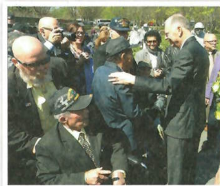
Rep. Posey discusses his Congressional Gold Medal legislation with veterans at the Korean War Memorial in Washington D.C.

The 65th Infantry Regiment was created by Congress in 1898 as an all-Puerto Rican segregated unit, was called upon to serve our nation in World War I, World War II and the Korean War and became known as the Borinqueneers. During the now-famous Battle of Chosin Reservoir during the Korean War, the Borinqueneers fought alongside the First Marine Division, covering them through what is recognized as one of the greatest strategic withdrawals in military history.