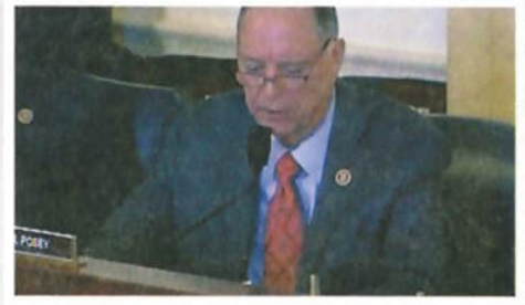
Rep. Posey questions VA officials about problems with the Veterans Choice Program in a recent hearing of the House Veterans Affairs Committee.