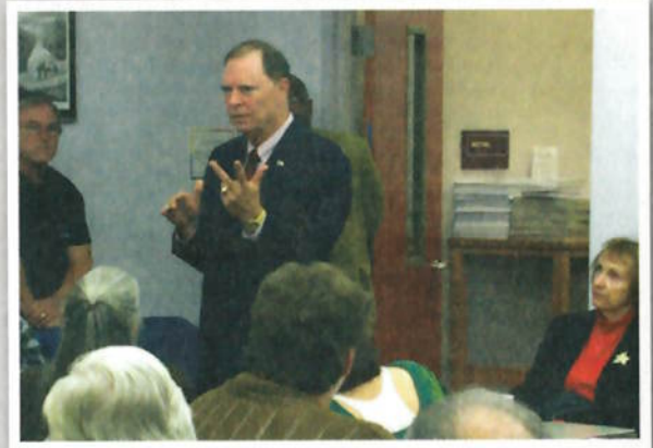
Rep. Posey talks about the issues before Congress with residents of Port St. John.