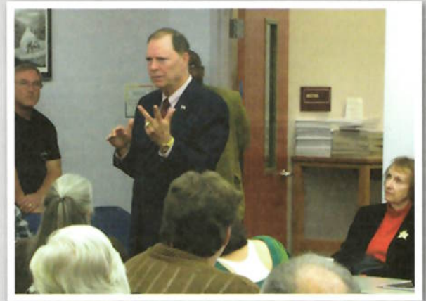
Rep. Posey talks about the issues before Congress with residents of Port St. John.