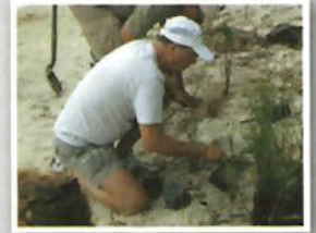
Rep. Posey tours the Indian River Lagoon and talks with volunteers participating in restoration efforts like planting mangroves.

✓ Saving stranded marine mammals – Restored funding for the Prescott Marine Mammal Rescue Assistance Program, which matches local funding to address manatee and dolphin strandings and deaths.