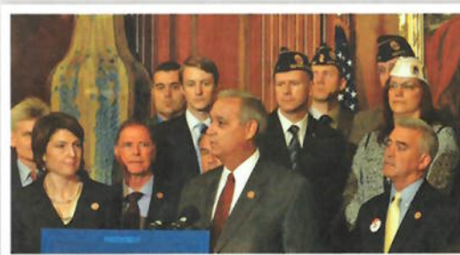
Rep. Posey attends a recent press conference in the Capitol calling on the Administration to hold the VA accountable for mistreatment of veterans.