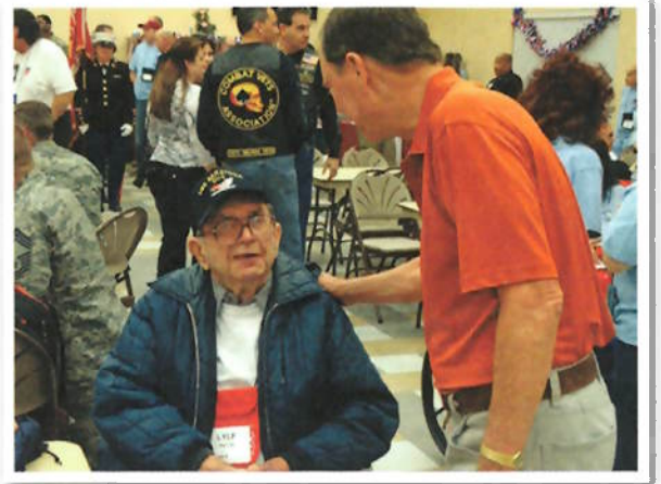
Rep. Posey meets with local veterans participating in a recent Honor Flight to Washington, DC.

“There’s nothing more important than making good on the promises made to our nation’s veterans...”