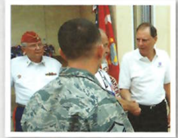
Rep. Posey meets with veterans to discuss issues before Congress.