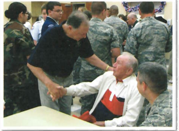
Rep. Posey meets with WWII Veterans participating in a recent Honor Flight.

"This is a bittersweet time, as we reflect on those who gave all to secure freedom for those they loved most."