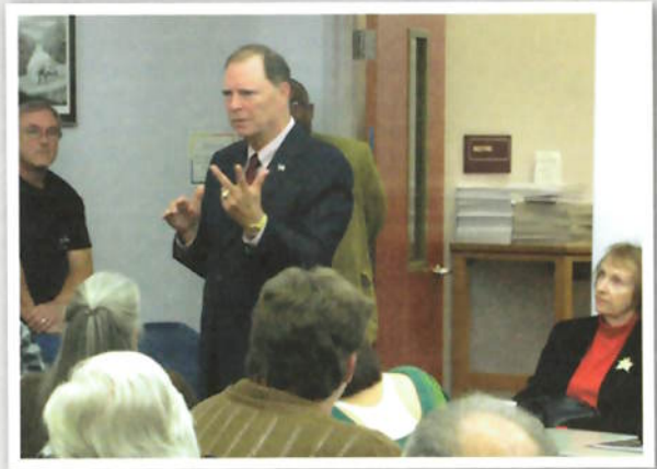
Rep. Posey talks about the issues before Congress with residents of Port St. John.