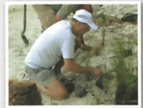
Rep. Posey tours the Indian River Lagoon and talks with volunteers participating in restoration efforts like planting mangroves.

✓ Saving stranded marine mammals – Restored funding for the Prescott Marine Mammal Rescue Assistance Program, which matches local funding to address manatee and dolphin strandings and deaths.