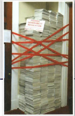
New and proposed federal regulations since April 2011