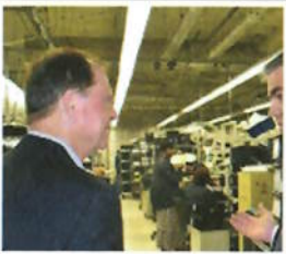
Rep. Posey recently met with employees at Rockwell Collins to talk defense issues and tour their Melbourne facility.

In May the House passed H.R. 2262, the SPACE Act, which included several of Rep. Posey's key proposals to help promote future commercial space ventures and streamline the regulatory process to make the U.S., and Florida, more competitive for commercial launches.