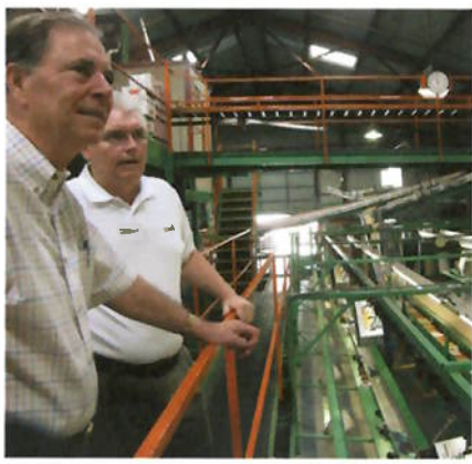
Rep. Posey talks economic issues with employees at Fellsmere Farms Groves.

Most folks don’t realize that the House and Senate operate by a different set of rules. In the House, a simple majority is enough to pass legislation. Current Senate rules require the agreement of 60 Senators before any legislation can be brought up for debate and a vote. Without bipartisan agreement, nothing can advance, and that is where the gridlock originates.