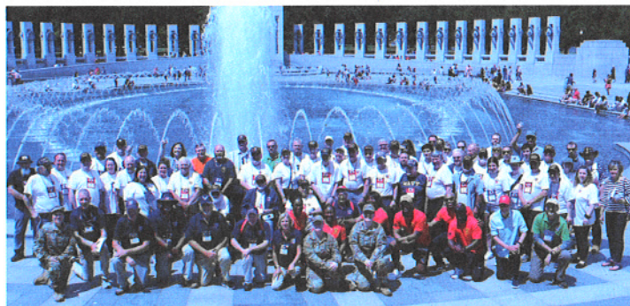
Congressman Posey updates Honor Flight veterans on legislative issues at the memorial in Washington, D.C in March.

"Because of the courage and dedication of our servicemembers and their families, America has stood strong." - Congressman Posey